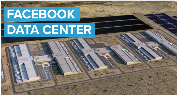
FACEBOOK DATA CENTER