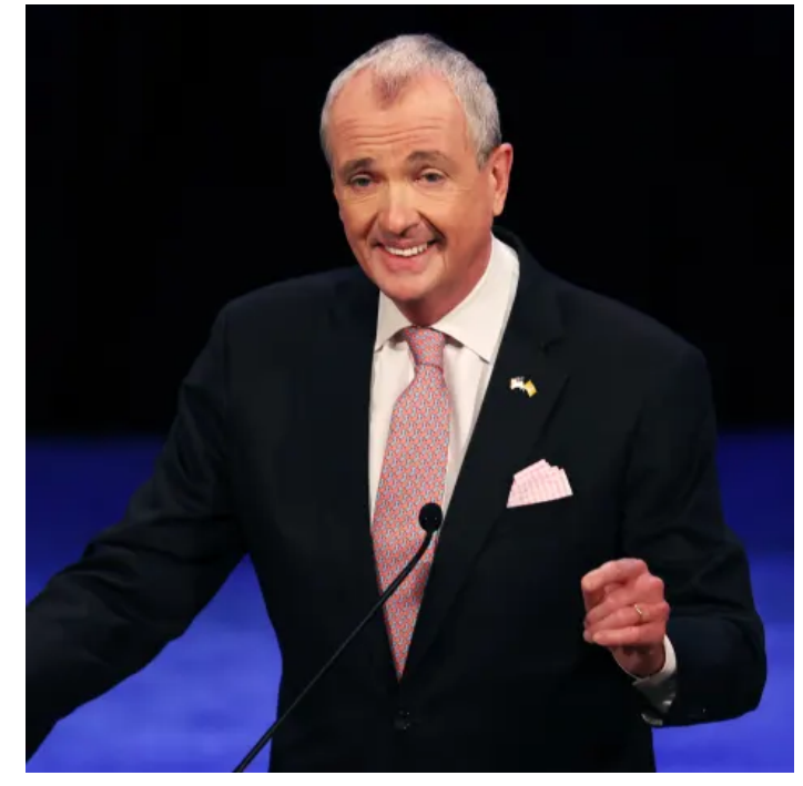
New Jersey is 2023's most-improved state for business, led by a strong economy and housing market