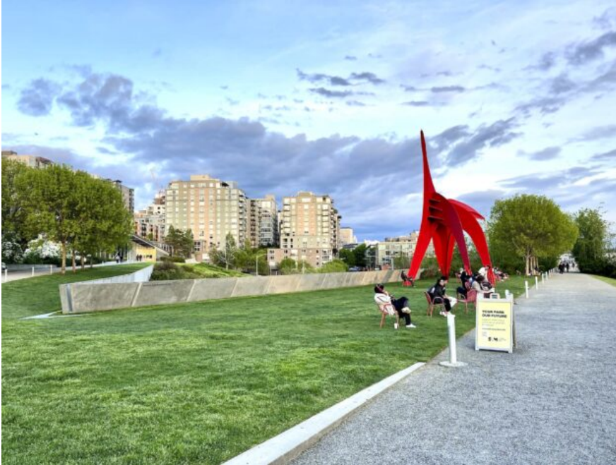
Seattle's Olympic Sculpture Park.

creatively, fostering social connection and engagement. Seattle is blessed with the Olympic Sculpture Park as well as a variety of public art. The Art in Public Places Program in Miami, Fort Collins, Greenville and many other cities allows artists to transform everyday spaces into artworks.