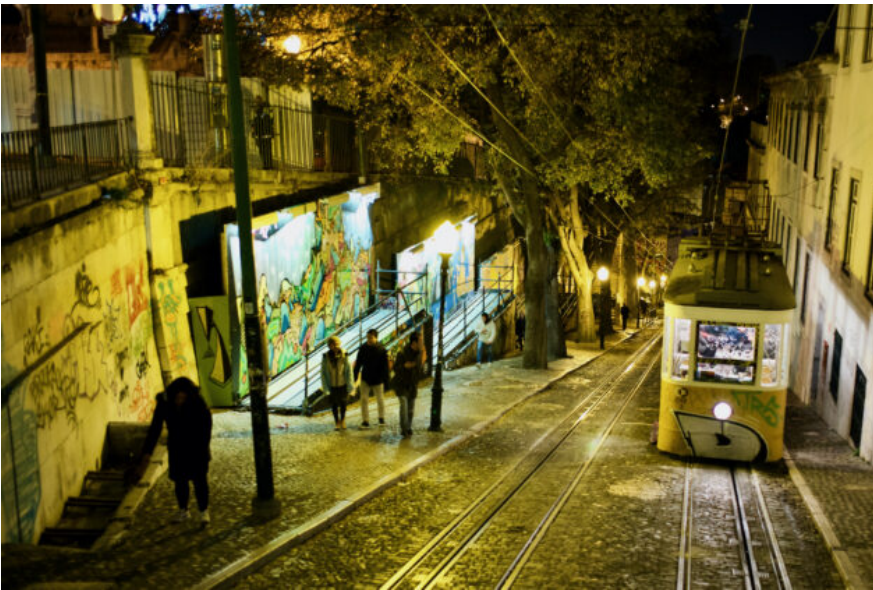
Colorful street art lines the streets of Lisbon, Portugal.